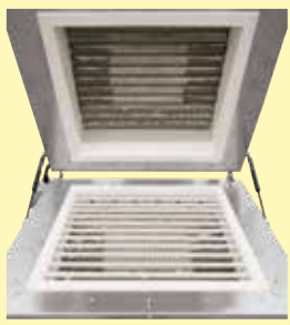
Floor and lid heating, two-zone control