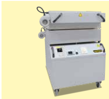
Fast-firing furnace LS 25/13