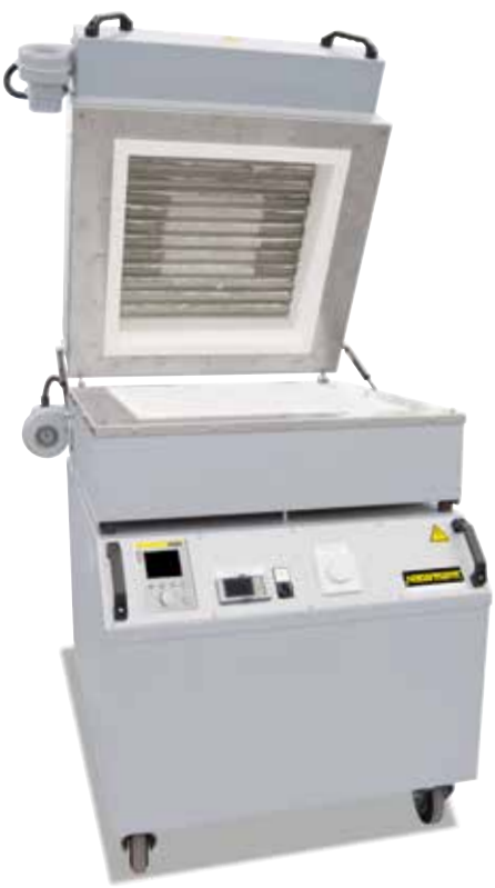
Fast-firing furnace LS 25/13

These fast-firing furnaces are ideal for simulation of typical fast-firing processes up to a maximum firing temperature of 1300 °C. The combination of high performance, low thermal mass and powerful cooling fans provides for cycle times from cold to cold up to 35 minutes with an opening temperature of approx. 300 °C.