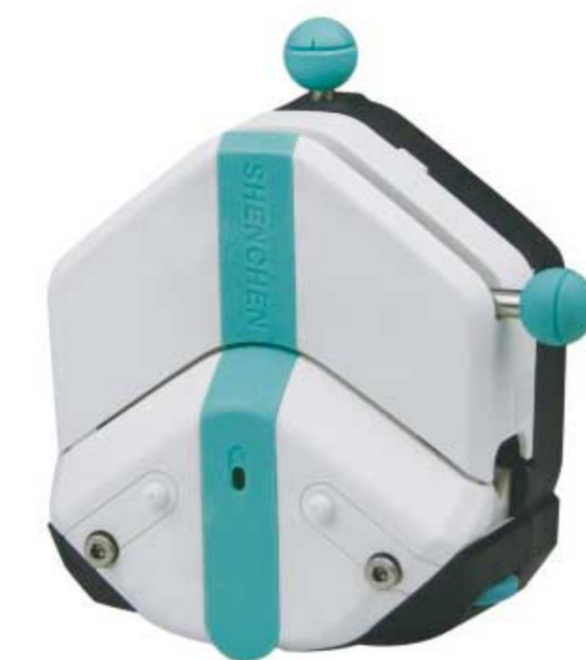
New Generation Easy Load Type Pump Head