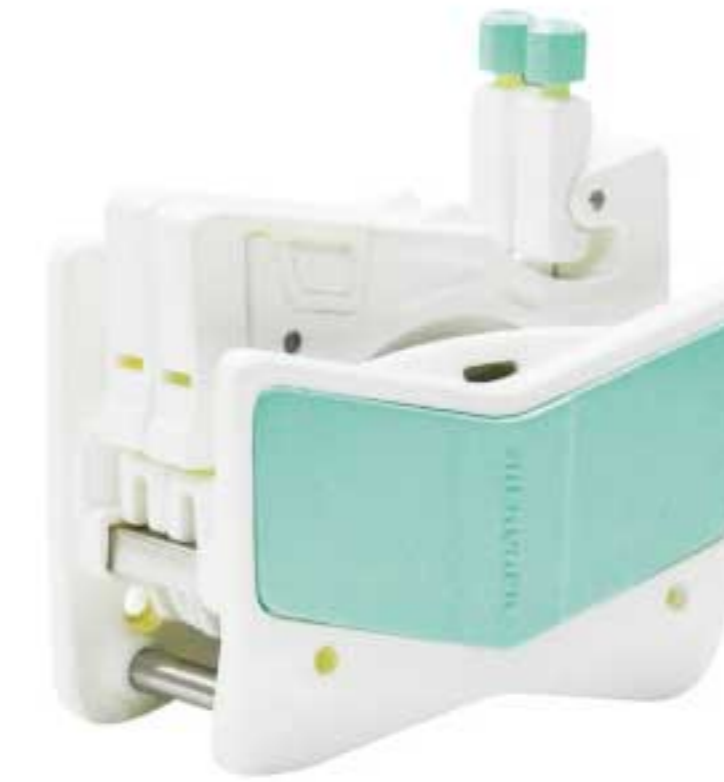
New Generation Multichannel Type pump Head