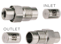
LC-10AD, LC-600, LC-9A