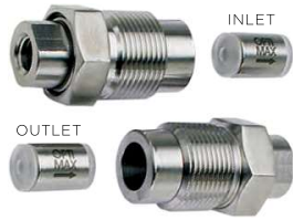
OPTI-MAX For Bischoff