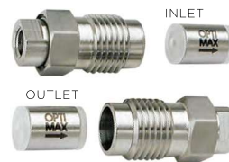
OPTI-MAX for Beckman/Altex

OPTIONS: Stainless steel/ceramic OPTI-MAX Cartridges are listed above. For other options, please see page 50.