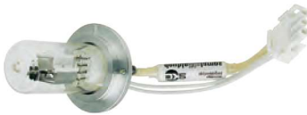
Agilent 1100 DAD 27-32-02845