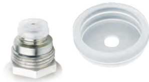
2-in-1 Seal Cap on Agilent