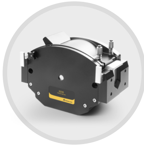
DZ45 Pump Head