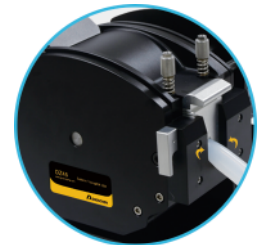
DZ45-II continuous tubing