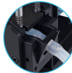
DZ45-I tubing with connector