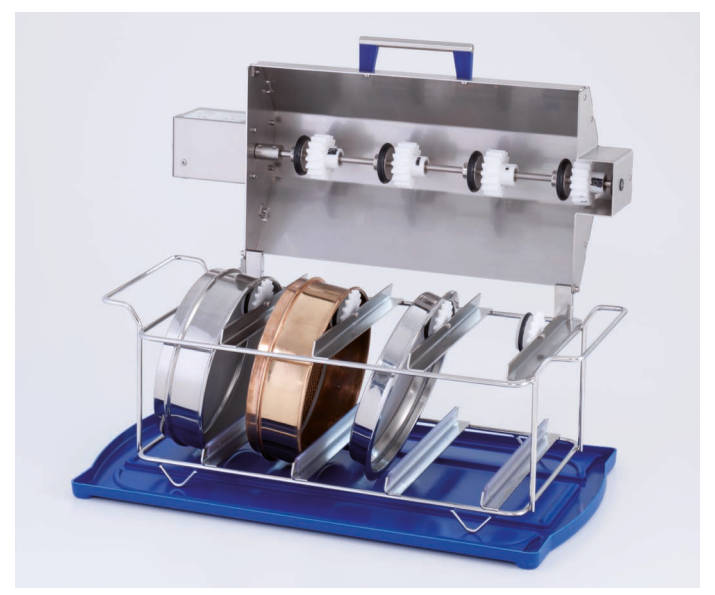
SRH 4/200 sieve cleaning module

In sieve analysis several sieves are used simultaneously. With the rotating module the throughput can be increased.