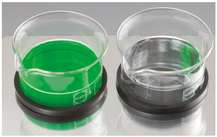
Cover with 2 holes, made of stainless steel

Especifically the Elmasonic S 120 (H) ultrasonic device is suitable for residual dirt analyses. Covers with holes and plastic tubs, developed for residual dirt analyses in the Elmasonic S 120 (H), facilitate the work. To prevent a recontamination, two glass beakers are inserted in the stainless-steel or PP-cover with holes. The ultrasound is transmitted through the liquid in the tank.