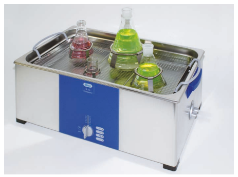
Elmasonic ultrasonic units with suitable accessories