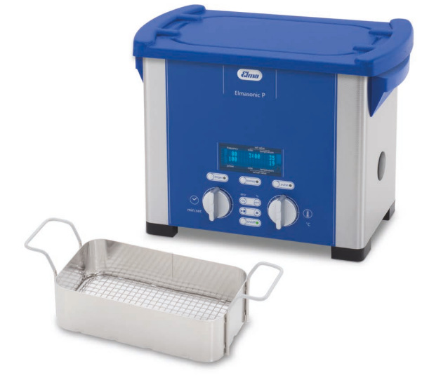
Elmasonic P 30 SE

Furthermore, the Elmasonic P 30 SE has all the functions as Sweep, Pulse or Degas and advantages of Elmasonic P series like temperature-controlled auto-start, etc.