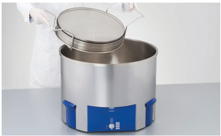
Elmasonic S 350 R