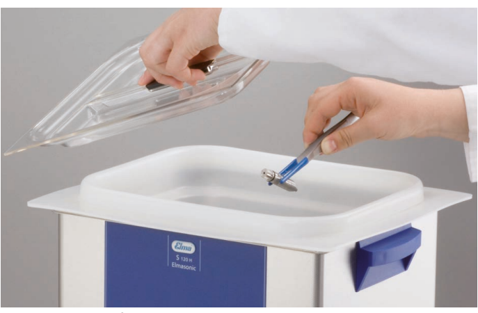
Plastic tub, made of PP

The right ultrasonic units with thoughtout accessories are crucial for a successful analysis. Ultrasound with its pre-defined parameters is a suitable and cost-saving method for this.