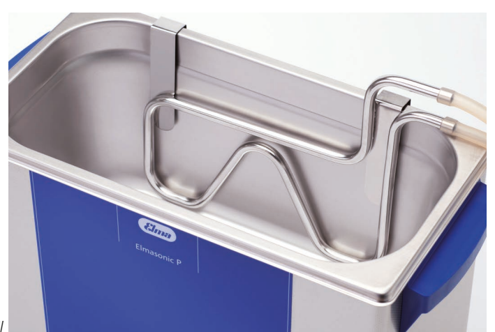
Elmasonic with cooling coil

The cooling coils can be connected to a customer-provided cryosatat or to the normal water supply.