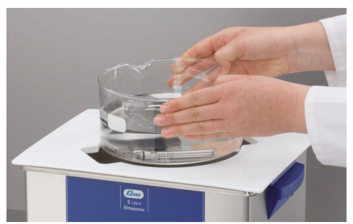
Cover with hole, made of PP

The right equipment for correct analysis results