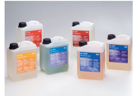
Elma Lab Clean series