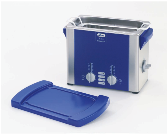
Elmasonic S 30 H with basket and cover

Elmasonic S units are thus reliable and cost-saving in daily use.