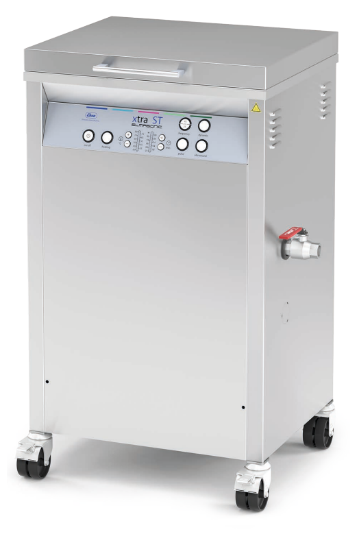
Elmasonic xtra ST 600H with hinged cover