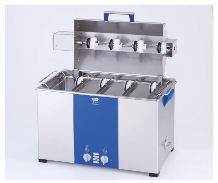
Elmasonic S 300 (H) with SRH 4/200 sieve cleaning module

The quality of cleaning results can be measured