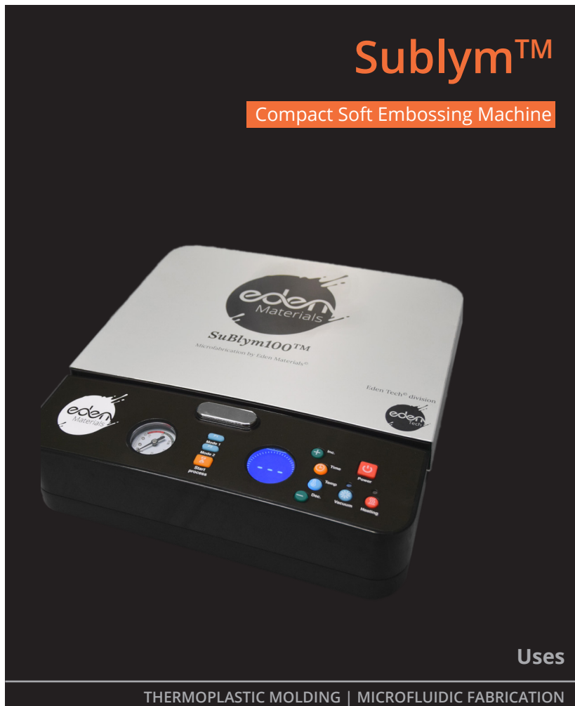
Compact Soft Embossing Machine